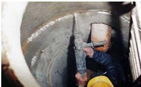
1. Pretreatment of cracks and joints