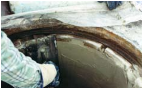
4. Reprofiling the top of the manhole with VANDEX RAPID S