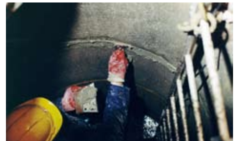
3. Sealing leaking joints with VANDEX RAPID M