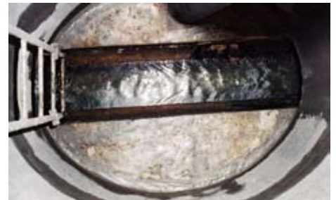
6. The refurbished manhole