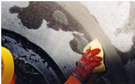
5. Smoothing of VANDEX RAPID S with a sponge