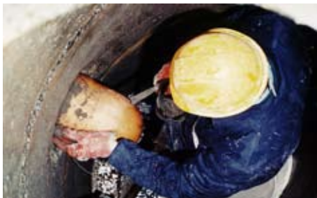
2. Plugging of damaged pipe inlets and joints